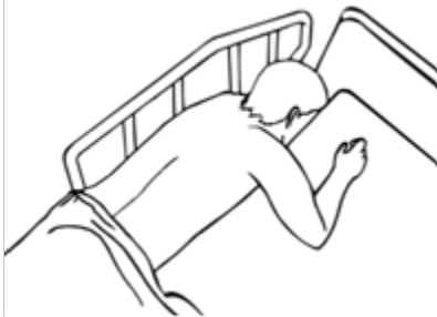
Zone 3 - Entrapment between the rail and the mattress