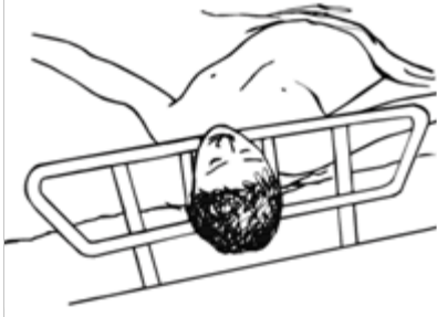
Zone 1 - Entrapment within the rail