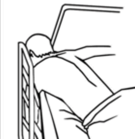
Zone 6 - Entrapment between the end of the rail and the side edge of the head or foot board