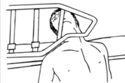
Zone 4 - Entrapment under the rail, at end of rail