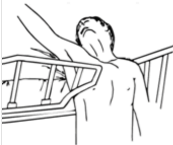
Zone 5 - Entrapment between split bed rails