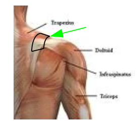
Figure 3. Location of Compressive Forces Posed by Use of Shoulder Strap.

Figure 3. Analyzer, Shoulder Strap, and Back Pack.